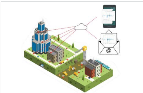
Geophysics GPR used Vista Data Vision to instantly gather data from 21 seismographs and other sensors, then automatically generate reports.

Because the University of Montreal sits near the top of Mount Royal, REM must connect to the university via an existing subway tunnel that was built between 1912 and 1918 that passes underneath the mountain. With the tunnel located some 70 meters below the location of the Edouard-Montpetit station, the connection requires the excavation of a shaft directly through hard metamorphic rock. Geophysics GPR was retained to provide vibration monitoring during the excavation to prevent damage to existing infrastructure, including university buildings, hundred-year-old water mains, and the subway tunnel, during blasting and general construction work.