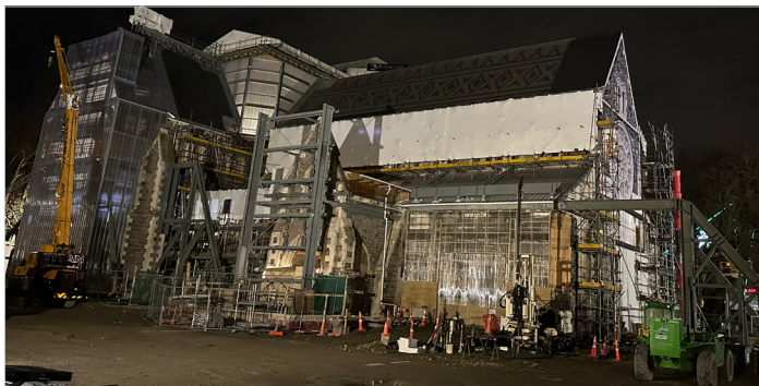
Real-time sensor data reduces the risk to people and infrastructure.